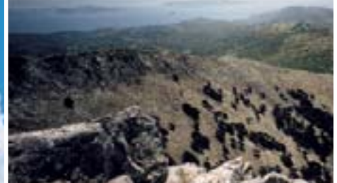
liew from Mt. Zas

Mt. Zas (3364 ft.) is the highest mountain not only of Naxos Island but of the Cyclades altogether.