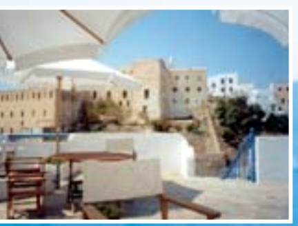
The castle – view from the roofgarden